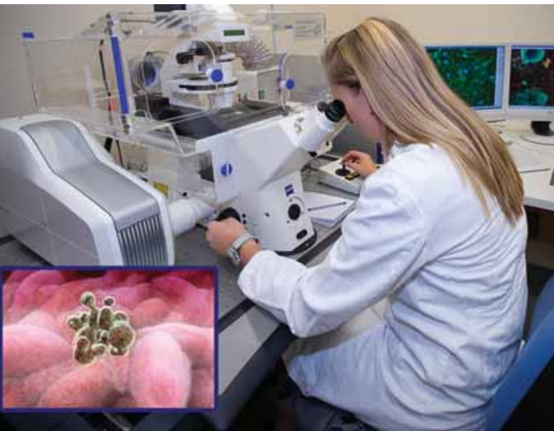
ACRF-funded research equipment

ACRF's multi-million dollar grants program for 2009 included four outstanding finalists. Each of the world-changing projects that reached the finals this year has the potential to move cancer research to another level.