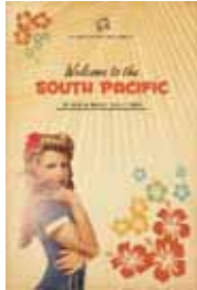
Stylish South Pacific invitation

ACRF's Cancerians Committees every year organise events which provide consistent income to help secure our grants. Thank you Cancerians Committee members for your long-term financial contribution and for the thousands of hours you spend to support ACRF's annual funding program.